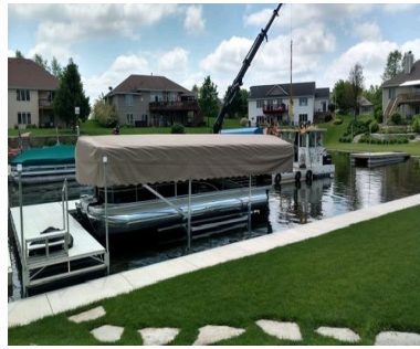
Dock with Pontoon Lift & Canopy

815-543-8742 (office) 815-243-8742 (cell) 815-654-8772 (fax)