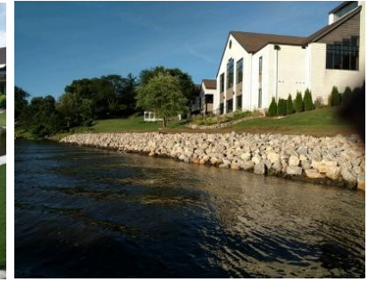
Shore Stabilization with Limestone Rip Rap wall

My fellow Rock River residents, I have been selling boat lifts and docks for 34 years on our beautiful Rock River. I would have to say I love the river and all it has to offer. Whether having fun on it in the summer or just looking at it on a cold winter day, I would not have asked for a better place to live. During the summer months after all the docks are in, I am able to help a few residents with shoreline work. Whether it's a small repair or a major job, I take great pride in every job. My goal is to have my work last a lifetime. I also do many odd jobs like trimming river trees that are only accessible by water. I know that I am sometimes hard to get a hold of, but once I commit to a job I make sure the work is done to the best of my ability. I look forward to the remaining summer with great excitement. If I can help you with a project, just drop me a message or send a text. Thanks again for the past 34 years and I look forward to the next 34!